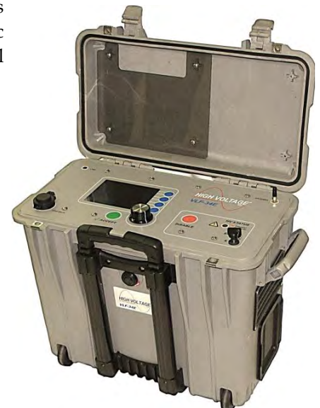
VLF34E Adv. 05.14 revA

The Source: It's an HVI: a world leader in VLF technology, with its VLFs shipped to over 80 countries. Models from 28 kVac - 200 kVac and up to 50 \mu F are available, as well as Tan Delta and Partial Discharge Diagnostics. HVI can help better than others by offering more product choices, vast application knowledge, test results interpretation, training, after sales support, and more.