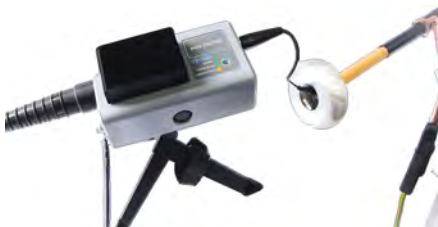
Model TD-34E Tan Delta Option